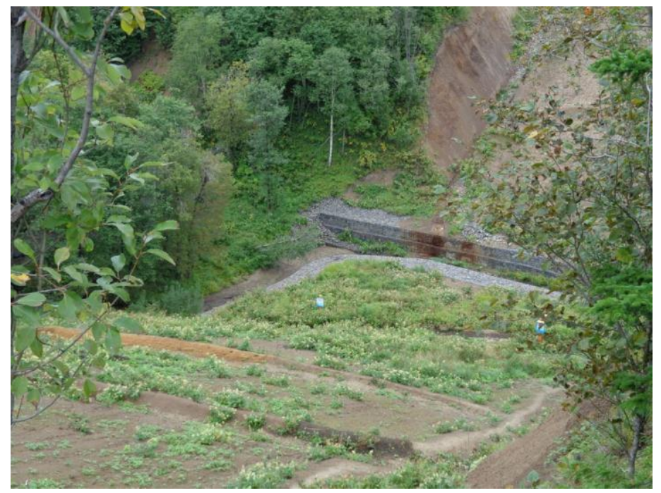
Photo 15 Slopes adjacent to R. Kormovaya with repairs to silt fencing required