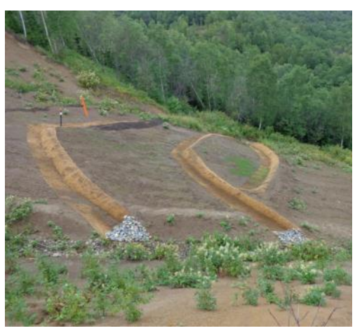
Photo 9 R. Kormovaya showing slope failure (2011) and repair works (2012)

As stated above, the vast majority of the slope breakers were well positioned and in good condition. However, there were a few sites where additional slope breakers could improve drainage. An example is the RoW slope at approximately KP 15 that exhibits erosion on the slope due to a lack of surface stabilisation from slope breakers and/or vegetation (see Photo 10).