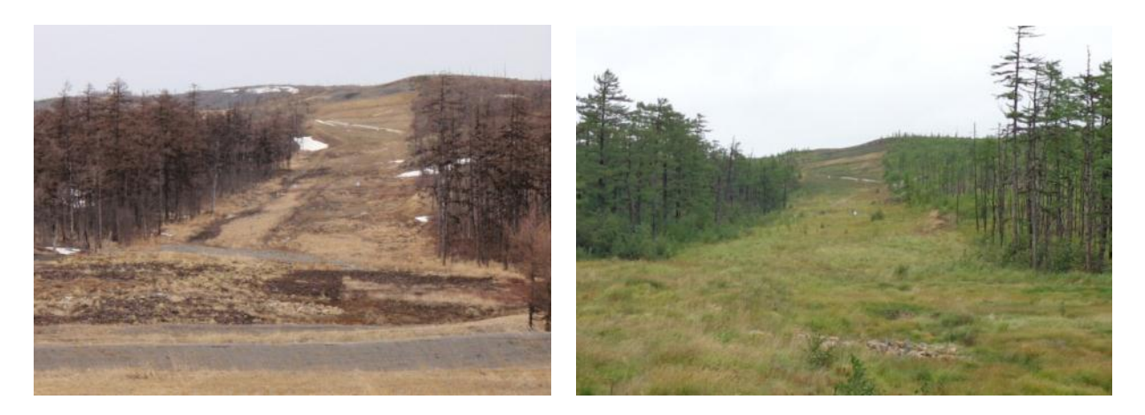
Photo 5 Comparison of re-vegetation on RoW near R. Khandusa in June 2010 (left) and September 2012 (right)

This year's monitoring visit further reinforced this trend and showed continued and marked improvement in re-vegetation and ground cover over the last 2 years – see for example the comparison of the condition of the RoW near the river Khandusa between June 2010 and September 2012 (Photo 5).