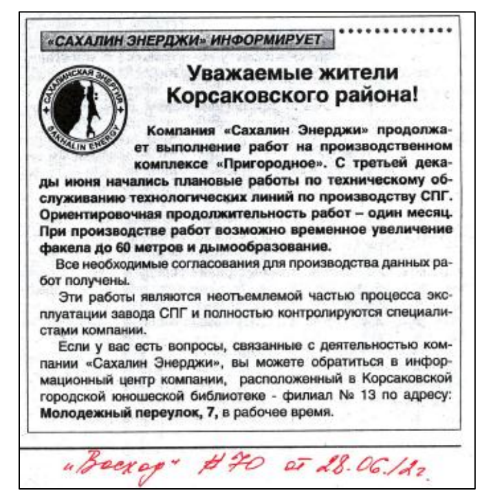
Figure 1: Notification of the planned maintenance works at the Prigorodnoye Production Complex ("Voskhod" newspaper, Issue 70 dated 28/06/2012)

And lastly, the Company's response reiterates that announcements of all planned maintenance works at the LNG Plant that can cause flare of a greater height and temporary smoke formation are published in the district newspaper "Voskhod", on average two weeks in advance of the works. The announcement also typically contains the details of Sakhalin Energy's Information Centre in Korsakov that can be contacted in case of any queries. A copy of such an announcement is provided below.