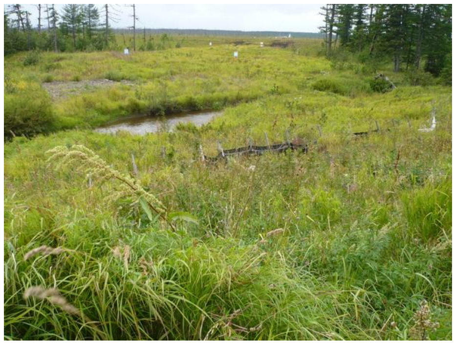
Photo 14 R. Tomi with good re-vegetation and redundant silt fence visible