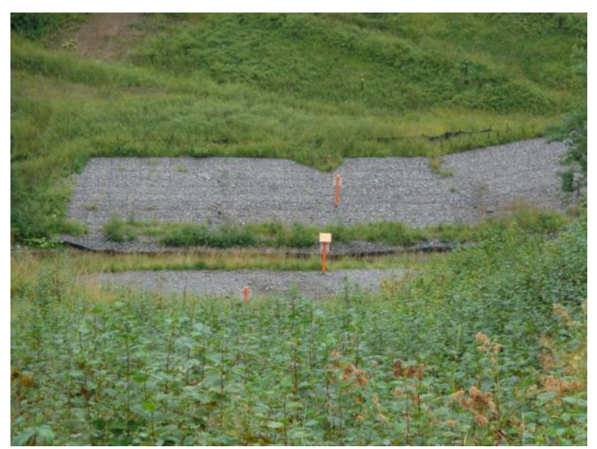
Photo 11 Slopes of the R. Krinka showing dense vegetation on geojute fortified slope breakers

However, there are other locations where geojute and/or coco matting have been installed and not yet degraded, but nonetheless re-vegetation efforts have yet to be successful. We recommend that such locations be re-evaluated by Sakhalin Energy and that reseeding and the potential use of fertilizer be considered (where it is not prohibited). Examples of such locations include the RoW near KP182 (see Photo 12), which has side slopes that have been covered with geojute but nonetheless remain poorly vegetated.