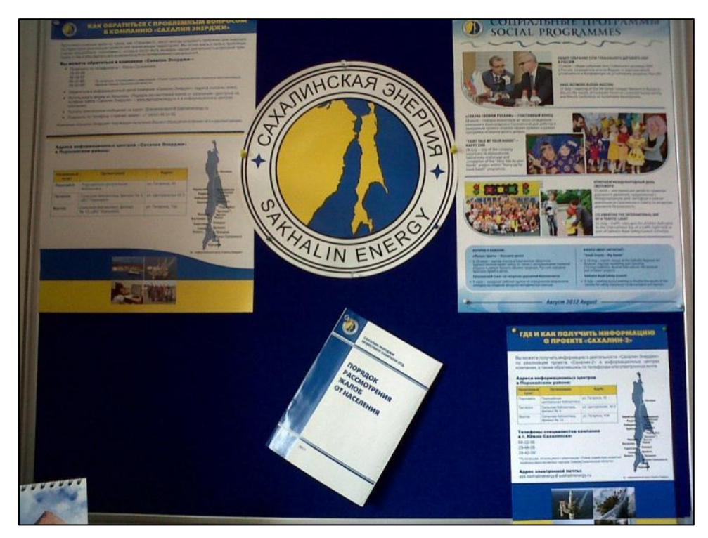
Photo 4 Public Grievance Brochure at the Board in Information Centre

To advertise and maintain awareness of the Procedure, the Company conducts an in-house and public information campaign on a regular basis. Externally, the Procedure is advertised through the dissemination of public leaflets through the Information Centres and at the contractor facilities, as part of the annual meetings with the local communities. Notifications are also published in the local printed media with the provision of contact details of the Company's CLO and the InfoCentres where complaints could be lodged. The means of filing a grievance are also described on Sakhalin Energy's external web-site.