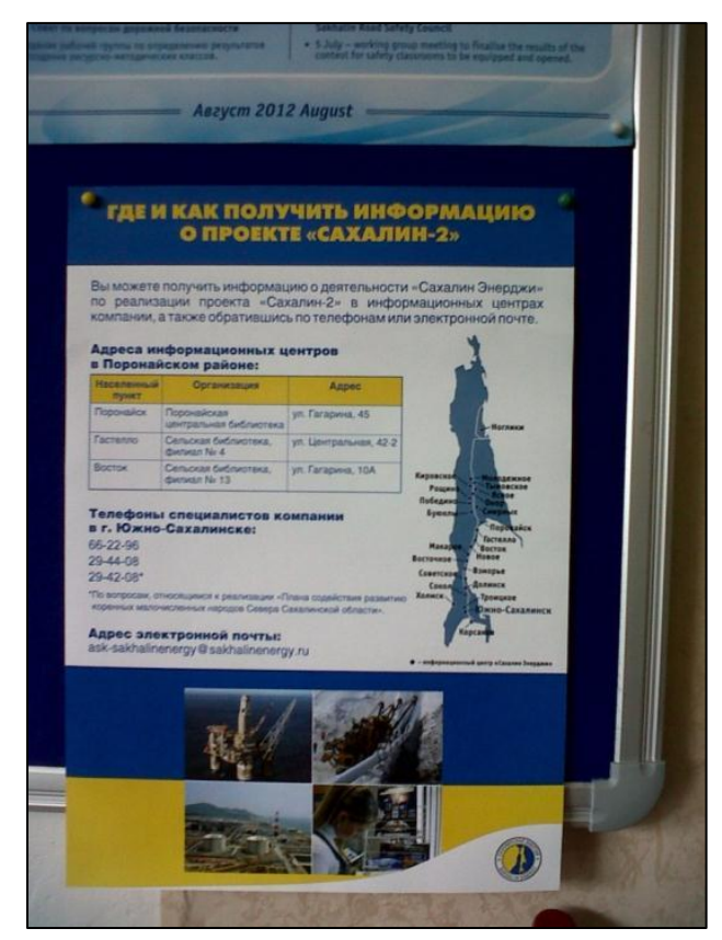
Photo 1 Poster with CLO contact details at the Company's Information Centre

The monitoring visit in 2012 has shown that the Centres are fully functional and represent one of the primary communication channels between Sakhalin Energy and the local communities.