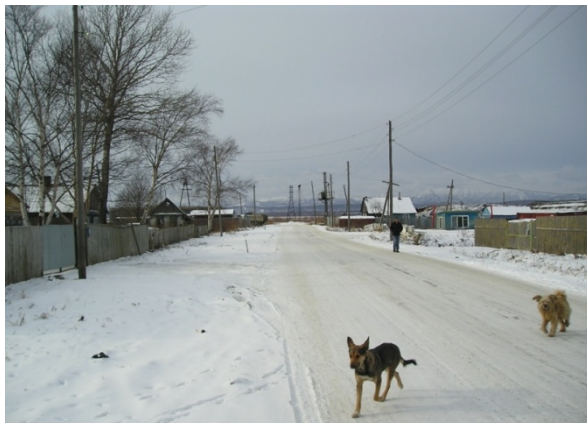
Road through the Lugovoye village (movement of passenger cars only)