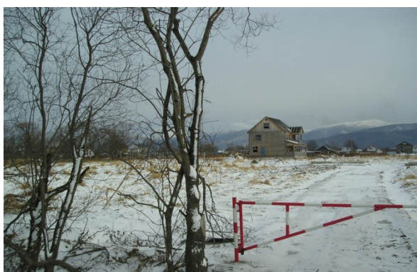
Building in Novaya village at a distance of 200 m from the road (empty at the time of on-site survey)