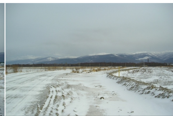
Road to the site (contract for use with SUAE Komsomolets)