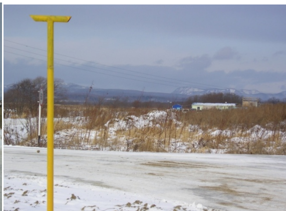
View of the temporary camp