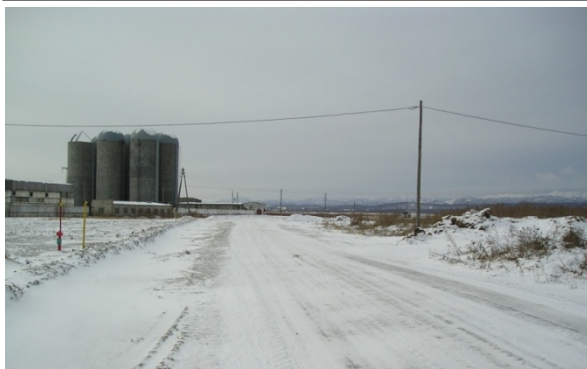
Road from the camp to the construction site