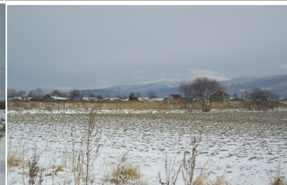
View of Novaya village from the road (to the site)