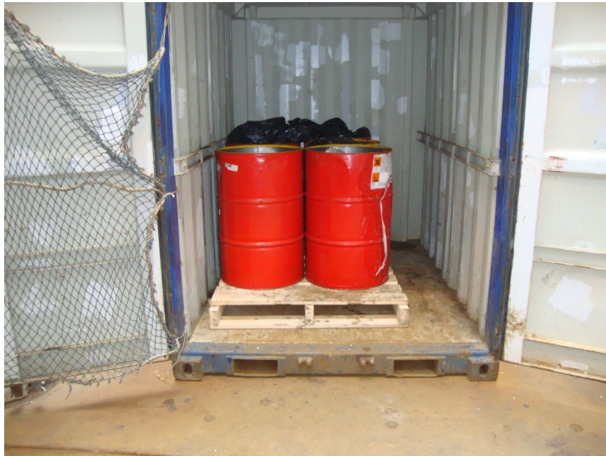
Photo 9. Bagged waste oily rags in within drums inside a shipping container