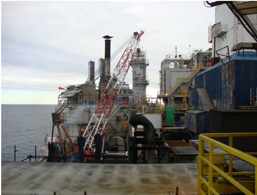
Photo 1. Generator and compressor exhausts