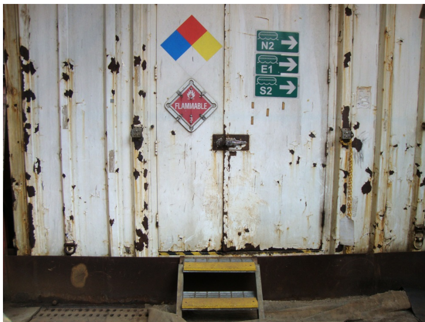
Photo 10. Exterior of main chemical store