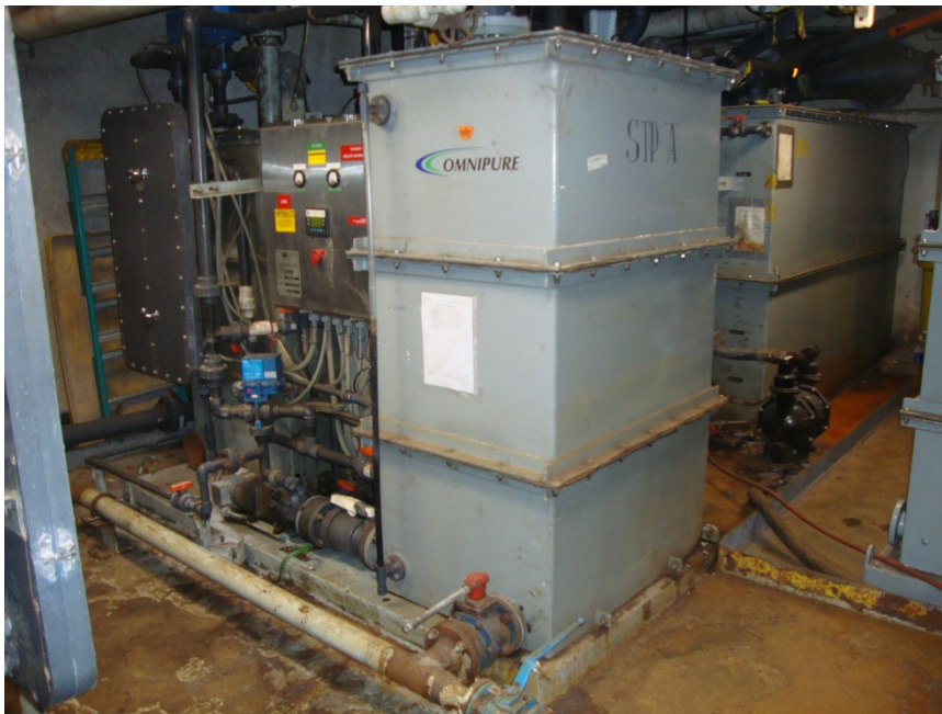
Photo 4. Sewage Treatment Plant 'A'. Unit 'B' is behind and the new Unit 'C' is to the right