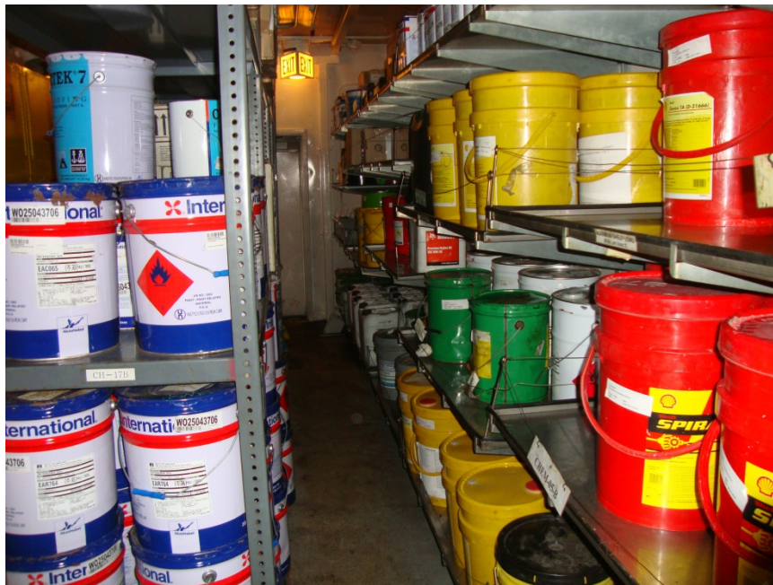
Photo 11. Interior of main chemical store