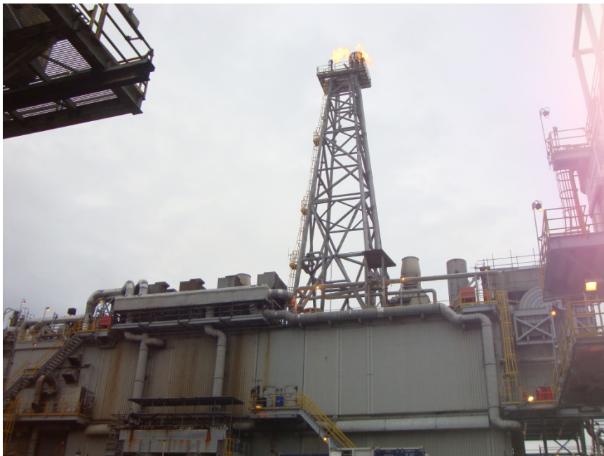
Photo 2. Flare