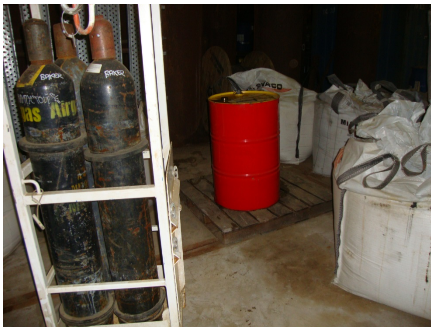
Photo 12. Drum in the 'core' without secondary containment