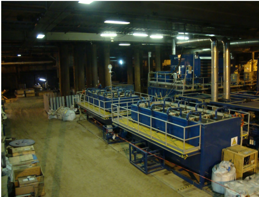
Photo 3. Exhaust ventilation fitted to machinery in the 'core'