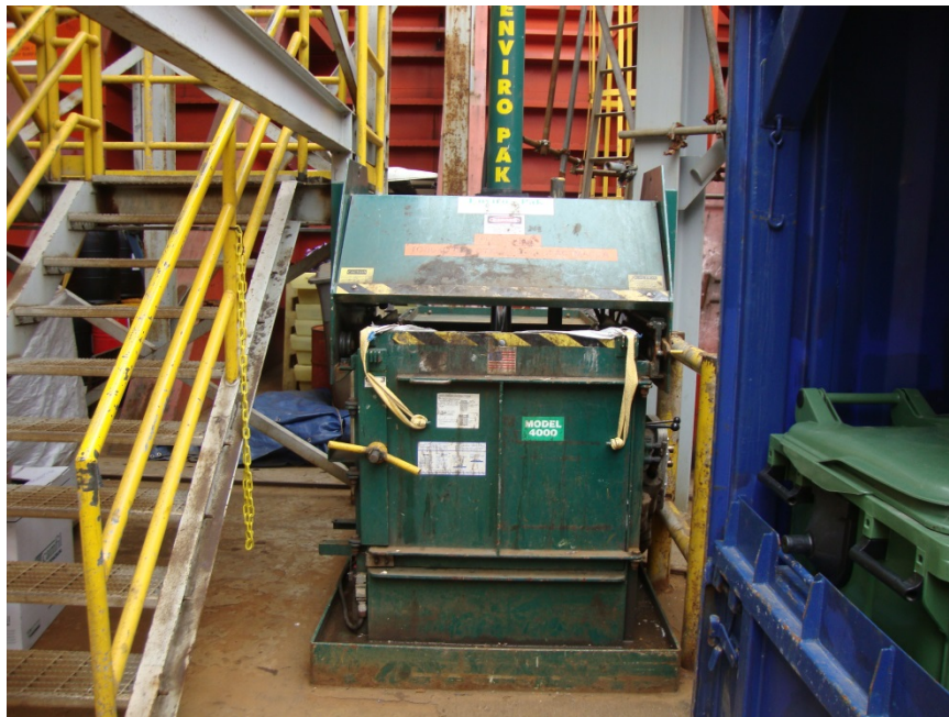
Photo 5. Waste plastic compactor on the main deck