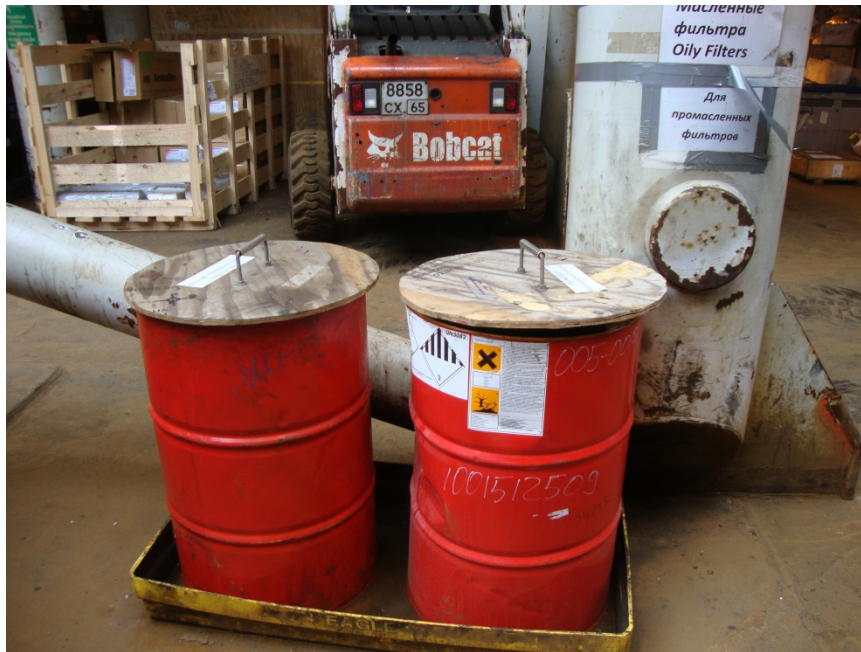
Photo 7. Waste oil filters stored within steel drums