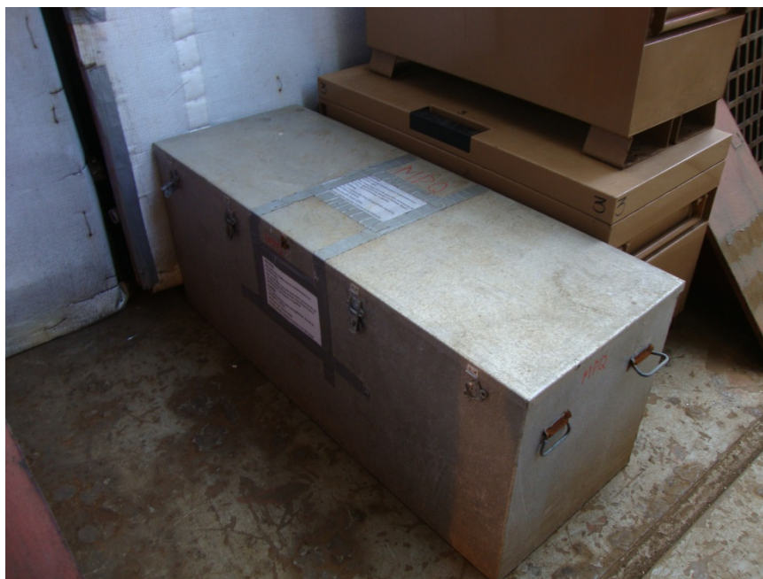
Photo 8. Waste fluorescent tubes within a steel box