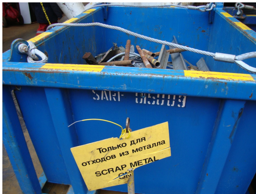
Photo 6. Scrap metal waste container on the main deck